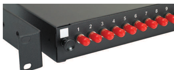
C. Adjustable fixing arms. clear port and panel labelling